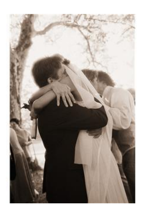
The Marriage Fix When It's Time To Get Professional Help

When a marriage is in trouble the best medicine for it would be to head to marriage counseling centre. These marriage counseling sessions are usually conducted by experienced individual whose main goal is to help save the marriage. Get all the info you need here.