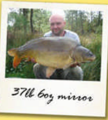
37lb 6oz mirror