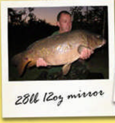
28lb 12oz mirror

Carp fishing doesn't have to cost the earth, either. Many anglers in the UK believe too much of the hype and marketing surrounding carp. We're also well aware that baits and tackle produced in the UK are often expensive to buy, especially overseas. Well, here's secret number one - the amount of carp you catch has NOTHING WHATSOEVER to do with the amount you spend! That may sound obvious to many, but you would have to see how much some guys in the UK spend to believe it!! UK Carp Fishing Secrets will show you how to make baits and rigs for small change!