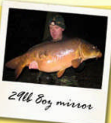
29lb 8oz mirror