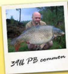
39lb PB common